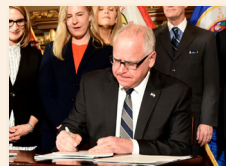
Legislative Changes Cover