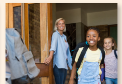
Especially for Schools – Summer Earnings Audit Page 3