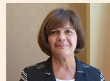
AIM Manager Retires, 46 Years of Service Page 3